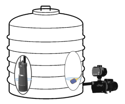
Prevent your pump from starting below a set water level.

Whenever you want low level 'dry-run' protection, want to select pump operating levels or for tank filling operation, this pre-wired float is a great choice.