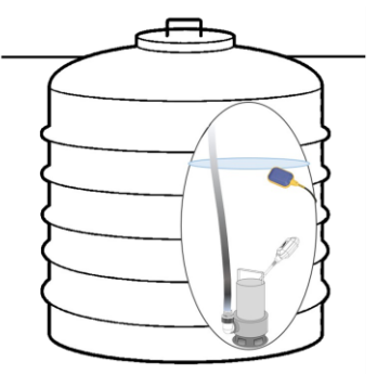
Delay the level at which a submersible pump fitted with a float begins to operate

Molded AS/NZS3112 (type 1) 3 pin plug. Durable, waterproof 15m H07 neoprene cable. 10amp rated. Nominal 1.8kW @ 230V